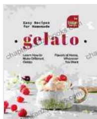
Image Alt Attribute: Mouthwatering image of various flavors of homemade gelato, arranged in colorful scoops and adorned with toppings.

Click here to Free Download your copy of "Easy Recipes for Homemade Gelato" now!