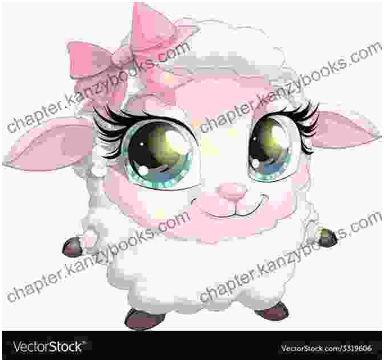
Fleece, the Friendly

Fleece is the epitome of kindness and inclusivity. He welcomes everyone with open arms, spreading joy and laughter wherever he goes. His infectious enthusiasm reminds us that true friendship knows no boundaries.